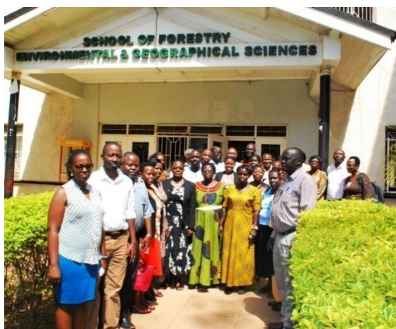
Participants pose for a group photograph after the training

The Centre for International Forestry Research (CIFOR) in partnership with Makerere University School of Forestry, Environmental and Geographical Sciences (SFEGS) and the Association of Uganda Professional Women in Agriculture and the Environment (AUPWAE) on 25 th October held a research dissemination workshop on addressing the gender gap in participation and representation in community forestry in Uganda.