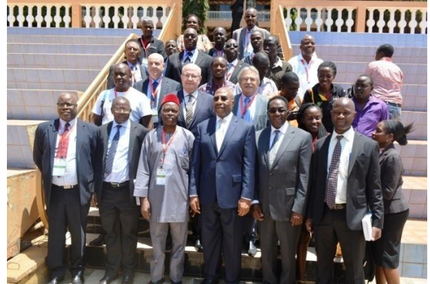
Conference participants pose for a group photo with the Prime Minister and the Vice Chancellor Mak after the opening ceremony

The 11th International Conference of the African Association of Remote Sensing of the Environment (AARSE) has been officially opened by the Prime Minister of Uganda the Rt. Hon. Ruhakana Rugunda. The premier urged scientists to move geospatial technology from the laboratories to the market place to address development challenges.